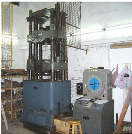
TESTING / PRUEBAS