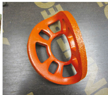
"RELAX" TREATMENT FOR COLD COUNTRIES