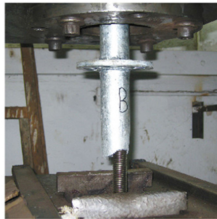
AFTER TEST / DESPUES DE