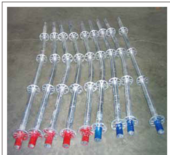
AFTER TEST / DESPUES DE